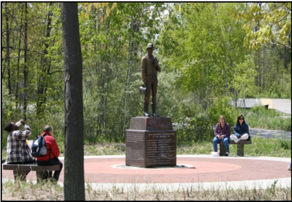
Above - The Tunnel Memorial sits directly above the tunnel and the miner looks out towards Lake Huron. The granite block below the miner is engraved with the names of the victims of the accident.

On August 21, 2007, thirty-six years after the tragedy, the memorial was dedicated to honor those killed on that fateful day in December of 1971. The memorial now serves as a constant reminder of those that gave their lives so that others would have safe drinking water.